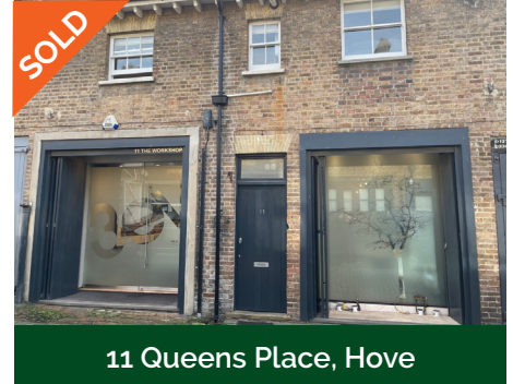
11 Queens Place, Hove