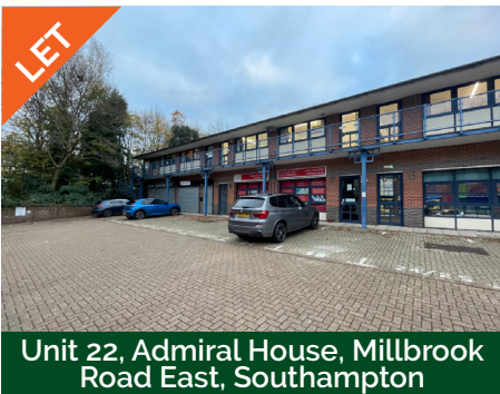
Unit 22, Admiral House, Millbrook Road East, Southampton