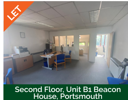
Second Floor, Unit B1 Beacon House, Portsmouth