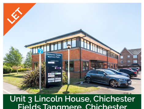
Unit 3 Lincoln House, Chichester Fields Tangmere, Chichester