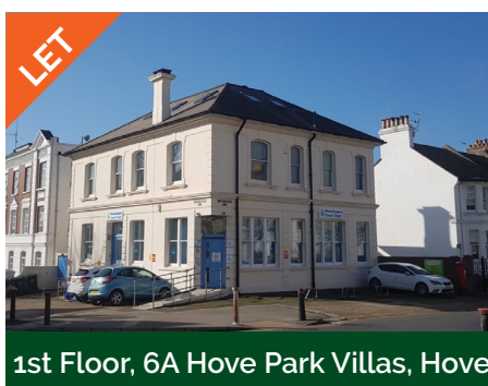
1st Floor, 6A Hove Park Villas, Hove