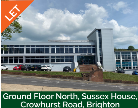
Ground Floor North, Sussex House, Crowhurst Road, Brighton