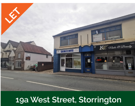
19a West Street, Storrington