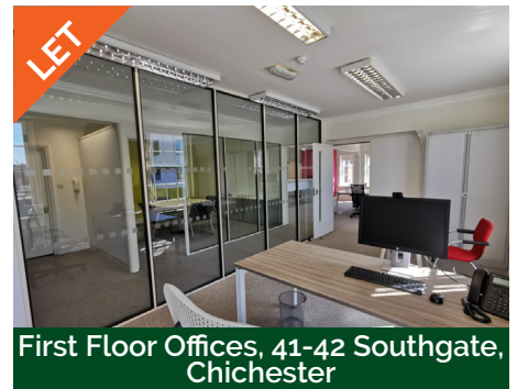
First Floor Offices, 41-42 Southgate, Chichester