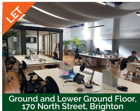
Ground and Lower Ground Floor, 170 North Street, Brighton