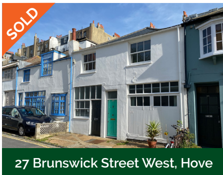
27 Brunswick Street West, Hove