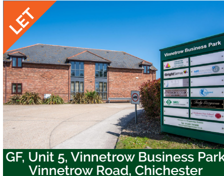
GF, Unit 5, Vinnetrow Business Park Vinnetrow Road, Chichester