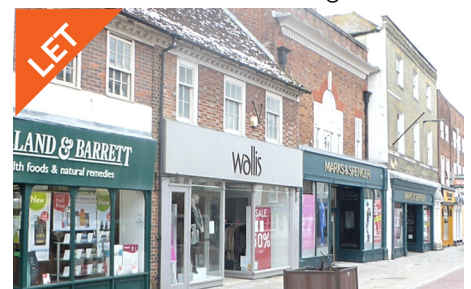
20 North Street, Chichester