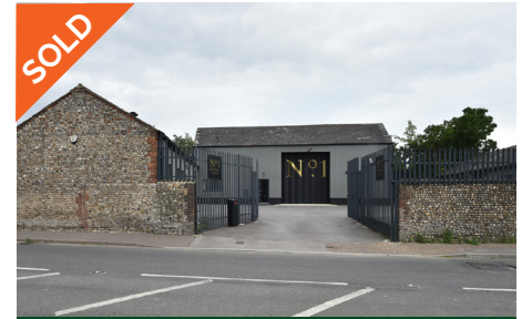
1 Fontwell Avenue, Eastergate