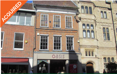
4 East Street, Chichester