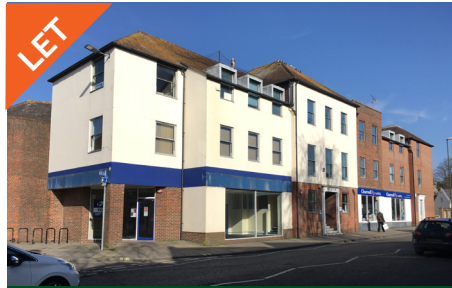
Unit 2F, Midland House, Market Avenue, Chichester