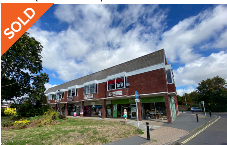
27A Stubbington Green, Fareham