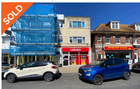
8-10 Pier Street, Lee-on-the-Solent