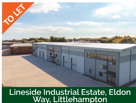
Lineside Industrial Estate, Eldon Way, Littlehampton