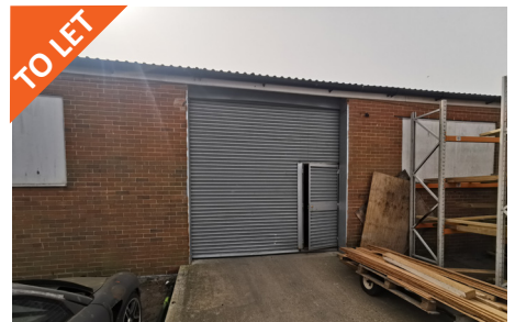
Unit 2, Plot 11 Burrfields Industrial Estate, Portsmouth