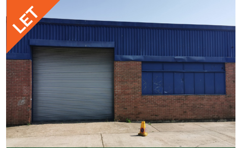
Unit 8C, The Skill Centre, Limerline Spur, Portsmouth