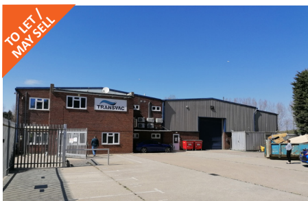
Unit B, Marlowe House, Rudford Industrial Estate, Ford