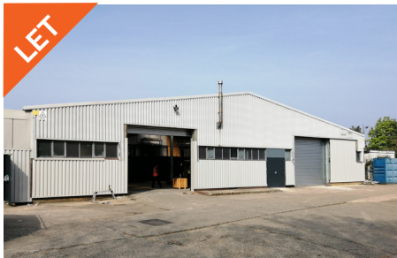
North Building, Leigh Road, Chichester