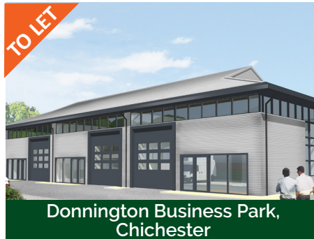
Donnington Business Park, Chichester