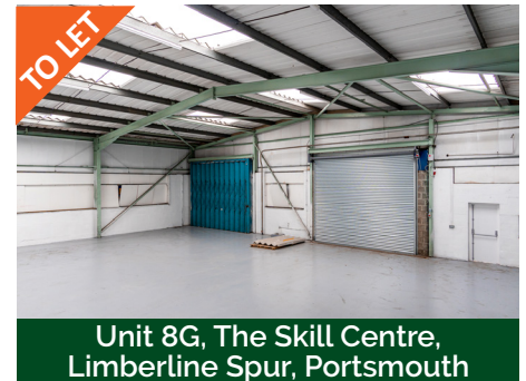
Unit 8G, The Skill Centre, Limberline Spur, Portsmouth