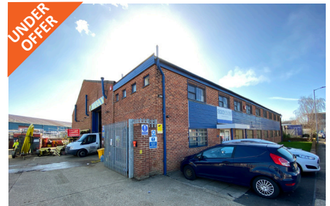
Plot 40, Quartremaine Road Industrial Estate, Portsmouth