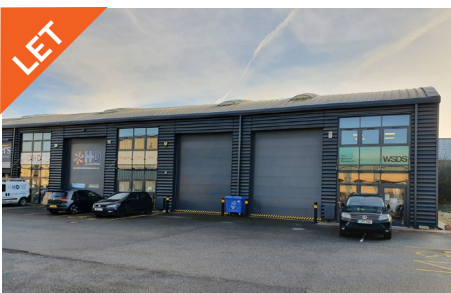
Unit 5, 1A William Way, Burgess Hill