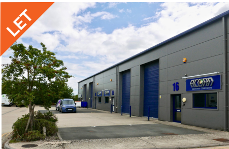
Unit 16, Mid Sussex Business Park, Ditchling Common, Hassocks