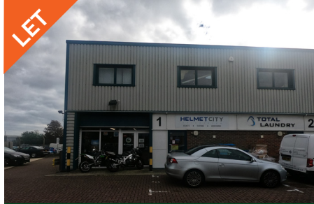
Unit 1, Phoenix Business Centre, Spur Road, Chichester