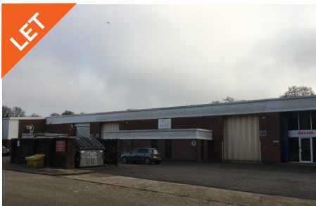
Unit 20-21, Holmbush Industrial Estate, Midhurst