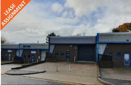
Unit 3, Cliffe Industrial Estate, South Street, Lewes