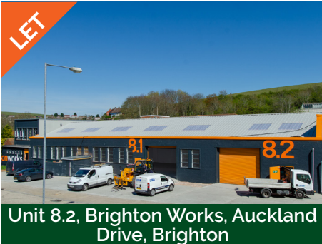
Unit 8.2, Brighton Works, Auckland Drive, Brighton