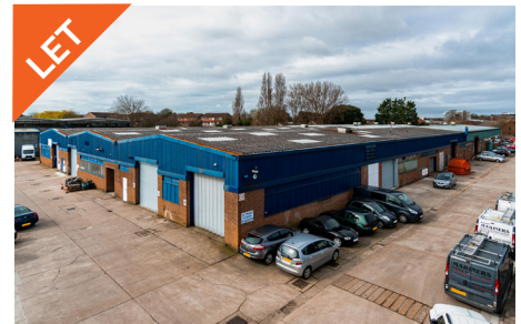
Unit 8E, The Skill Centre, Limerline Spur, Portsmouth