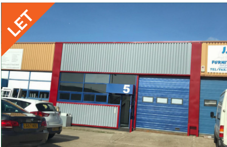
Unit 5, Malling Industrial Estate, Brooks Road, Lewes