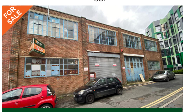
25 Freehold Terrace, Brighton