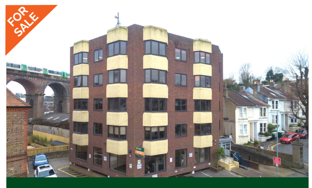
Dyke Road Drive, Brighton