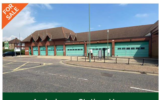
Ambulance Station, Hove