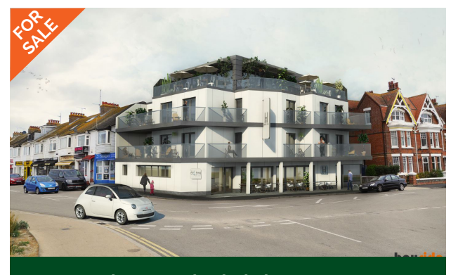
Pier Road, Littlehampton