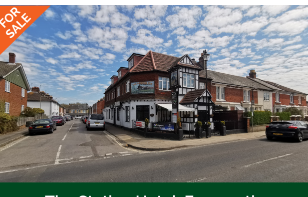
The Station Hotel, Emsworth