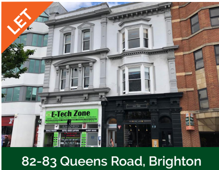
82-83 Queens Road, Brighton • 7,470 sq ft Class B1 unit • Let to Wrap Workspace