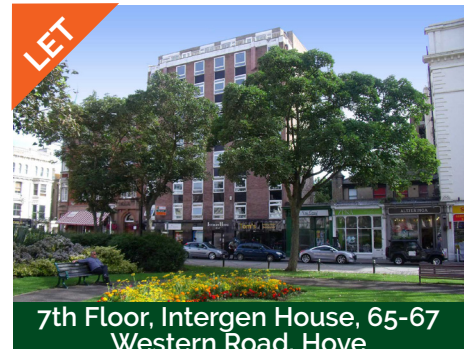
7th Floor, Intergen House, 65-67 Western Road, Hove • 1,550 sq ft Class B1 unit • Let to an offshore energy consultancy