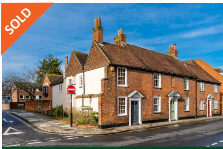
1 Chapel Street, Chichester