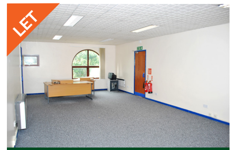
Beacon House, Unit B2, Northumberland Road, Southsea