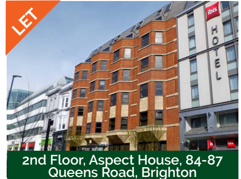
2nd Floor, Aspect House, 84-87 Queens Road, Brighton • 4,003 sq ft Class B1 unit • Let to a gaming developer