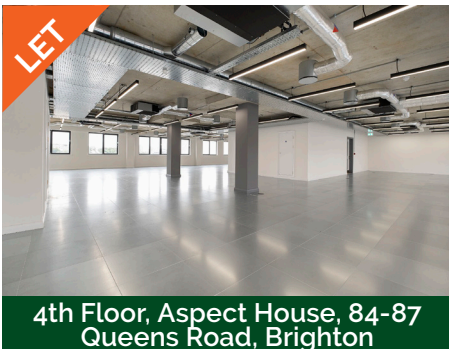
4th Floor, Aspect House, 84-87 Queens Road, Brighton • 4,003 sq ft Class B1 unit • Let to a health-tech developer