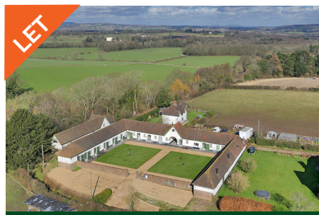
Barlavington Estate, Petworth