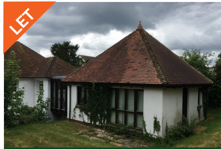
1st Floor Office, 62 Lower Street, Pulborough