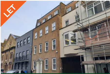
Apex House, 69 – 70 Middle Street, Brighton