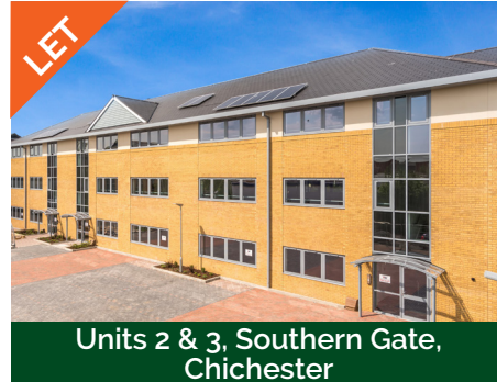
Units 2 & 3, Southern Gate, Chichester • 10,000 sq ft Class B1 unit • Let to the DWP