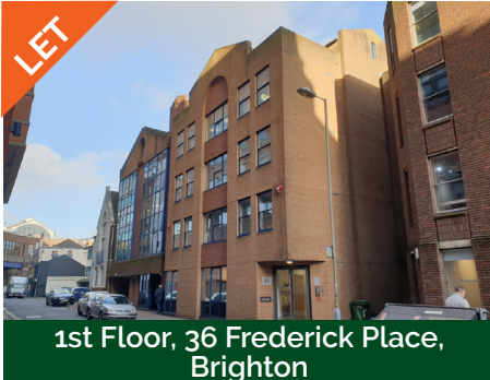
1st Floor, 36 Frederick Place, Brighton • 1,438 sq ft Class B1 unit • Let to an IT services provider