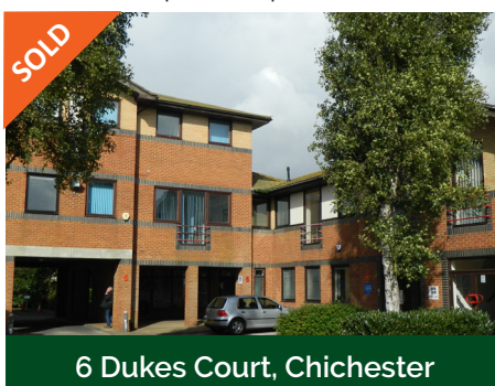
6 Dukes Court, Chichester • 675 sq ft Class B1 unit • Sold to an owner occupier