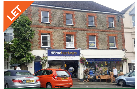
1A Market Square, Petworth