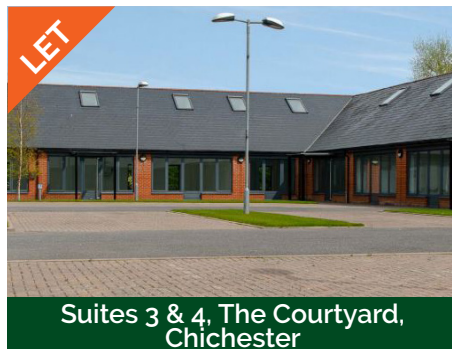
Suites 3 & 4, The Courtyard, Chichester • 3,380 sq ft Class B1 unit • Let to a healthcare provider