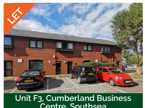
Unit F3, Cumberland Business Centre, Southsea • 691 sq ft Class B1 unit • Let to a private company