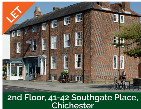
2nd Floor, 41-42 Southgate Place, Chichester • 1,475 sq ft Class B1 unit • Let to Plant Planet