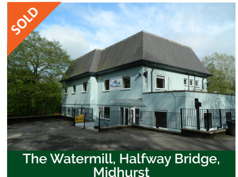
The Watermill, Halfway Bridge, Midhurst • 6,805 sq ft Class B1 unit • Sold to a private investor