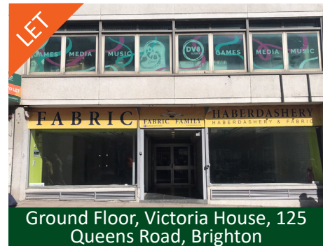
Ground Floor, Victoria House, 125 Queens Road, Brighton