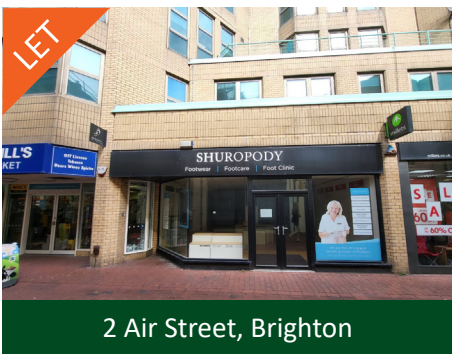
2 Air Street, Brighton