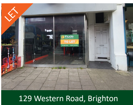
129 Western Road, Brighton