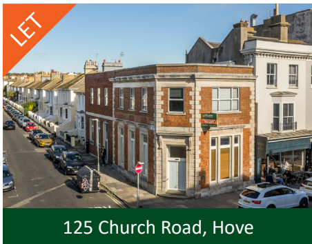
125 Church Road, Hove