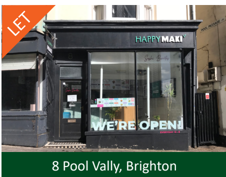
8 Pool Vally, Brighton