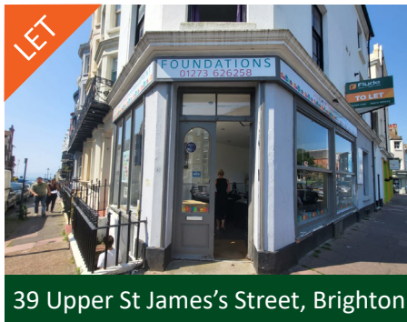
39 Upper St James's Street, Brighton