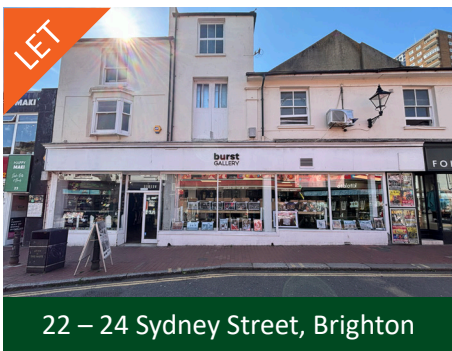
22 – 24 Sydney Street, Brighton