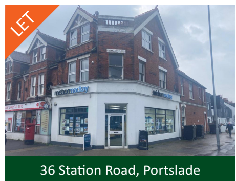
36 Station Road, Portslade