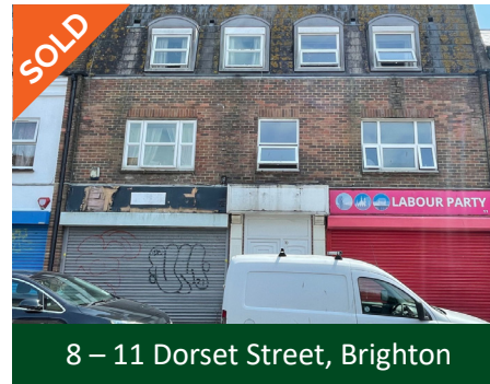
8 – 11 Dorset Street, Brighton