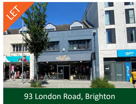
93 London Road, Brighton