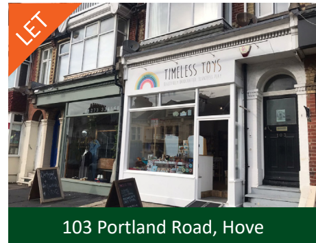
103 Portland Road, Hove