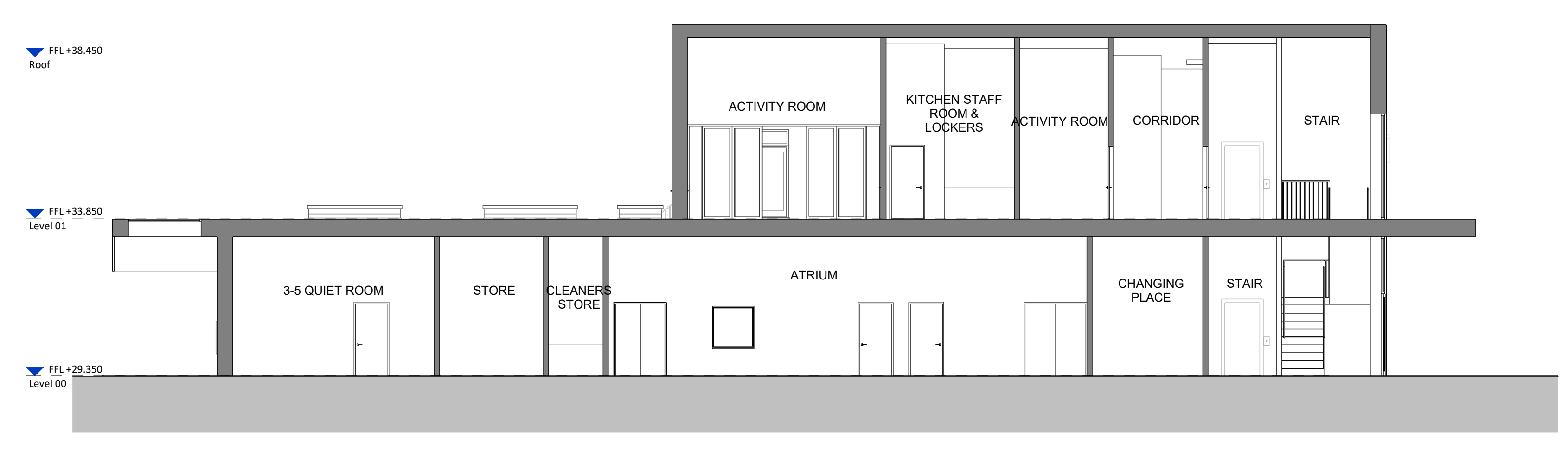
Section A-A 1:100