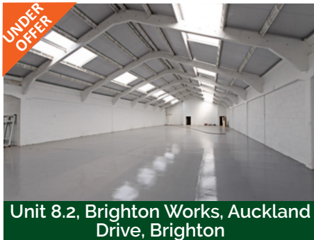
Unit 8.2, Brighton Works, Auckland Drive, Brighton