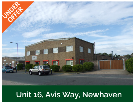
Unit 16, Avis Way, Newhaven