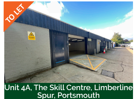
Unit 4A, The Skill Centre, Limberline Spur, Portsmouth