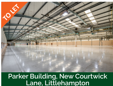
Parker Building, New Courtwick Lane, Littlehampton