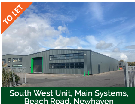
South West Unit, Main Systems, Beach Road, Newhaven