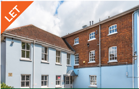
Suites 2 & 3, The Victoria, 25 St. Pancras, Chichester • 1,058 sq ft Class B1/E unit • Let to My Student Let