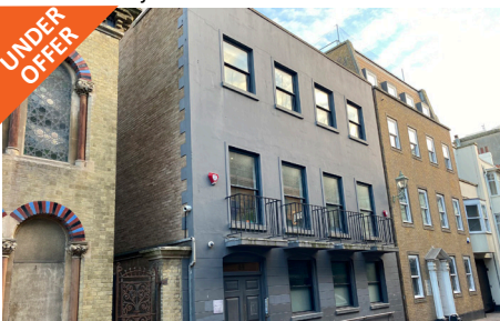
68 Middle Street, Brighton • 5,271 sq ft Class B1/E unit • Under offer