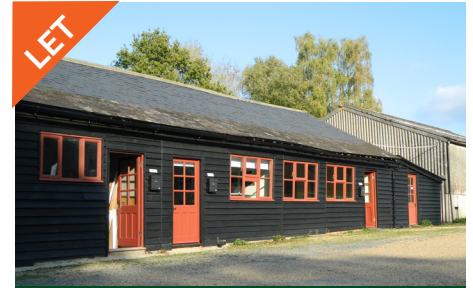
Carpenter's Workshop, The Old Sawyard, Parham Park, Pulborough • 877 sq ft Class B1/E unit • Let to Cosy Nest Interiors