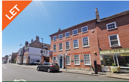
44 North Street, Chichester • 700 sq ft Class B1/E unit • Let to Marchwood IFA