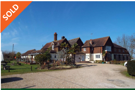
Tottington Manor Hotel, Edburton Road, Henfield