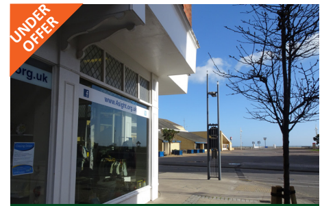
7 York Road, Bognor Regis