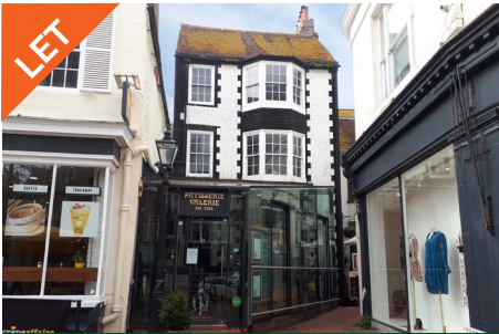
36 East Street, Brighton