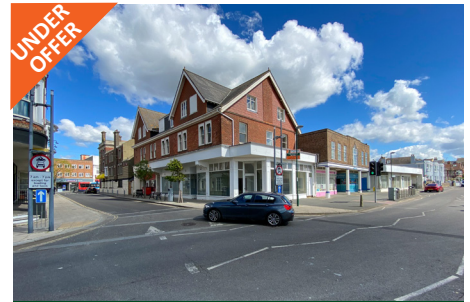
9-11 York Road, Bognor Regis