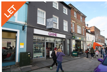
30 South Street, Chichester