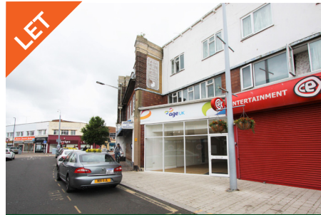
1 Water Tower Buildings, London Road, Bognor Regis