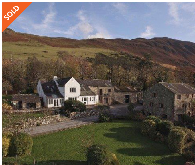
Parkergate Farmhouse & Cottages, Bassenthwaite, Keswick