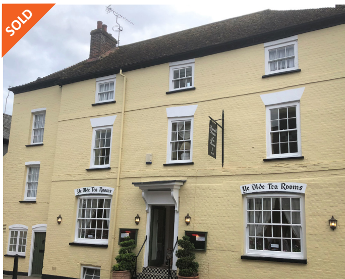
Arundel House, 11 High Street, Arundel