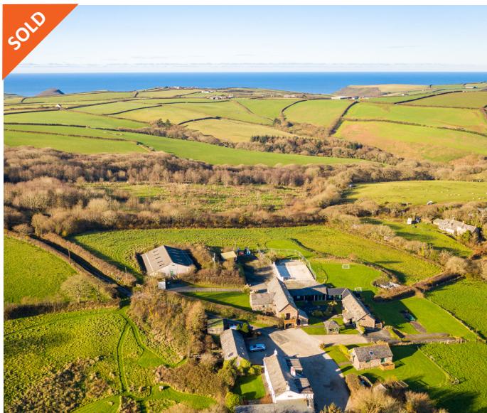
Treworgie Barton Cottages, St Gennys, Bude