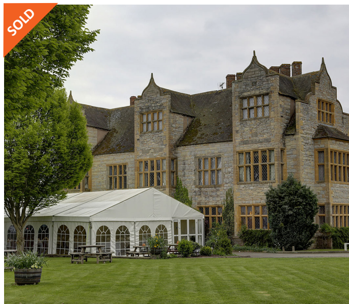
Salford Hall Hotel, Abbot's Salford, Evesham