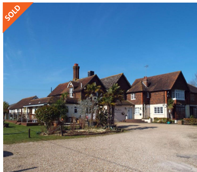
Tottington Manor Hotel, Edburton Road, Henfield