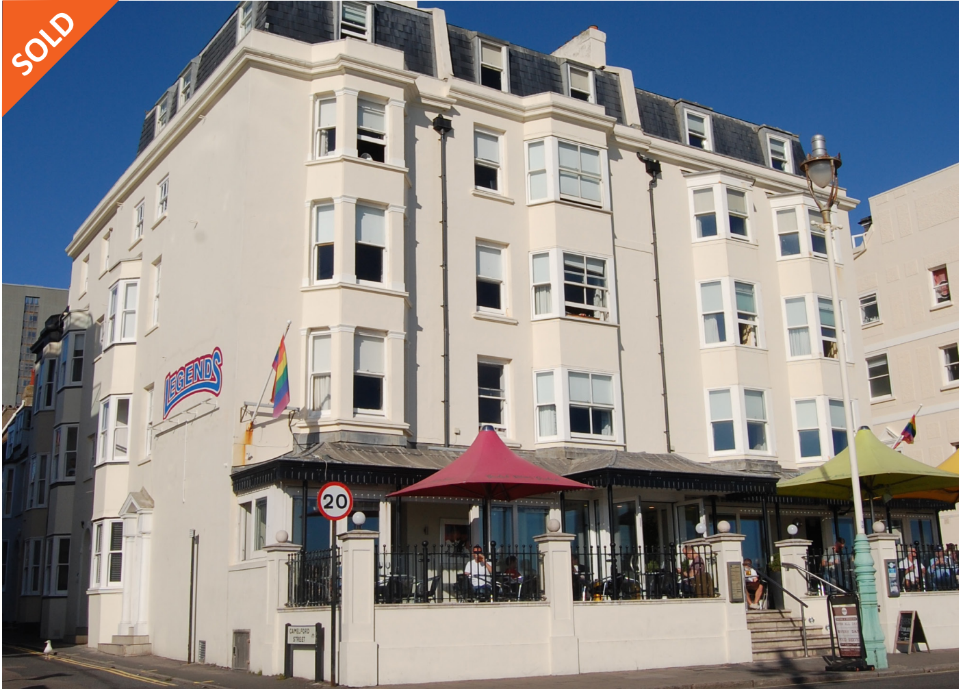
31-34 Marine Parade, Kemptown, Brighton