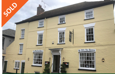
Arundel House, 11 High Street, Arundel