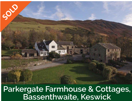
Parkergate Farmhouse & Cottages, Bassenthwaite, Keswick