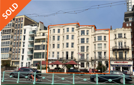
Granville and Cecil Hotels, 124 Kings Road, Brighton