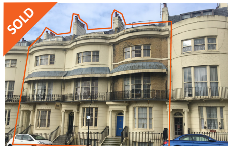
Tops and Dove Hotel, Regency Square, Brighton