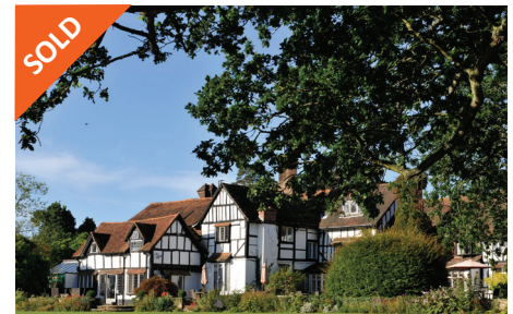
Ghyll Manor Hotel & Restaurant, High Street, Rusper, Horsham