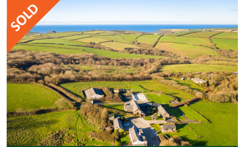
Treworgie Barton Cottages, St Gennys, Bude