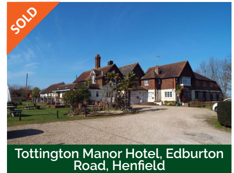
Tottenham Manor Hotel, Edburton Road, Henfield