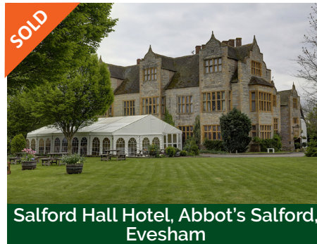
Salford Hall Hotel, Abbot's Salford, Evesham