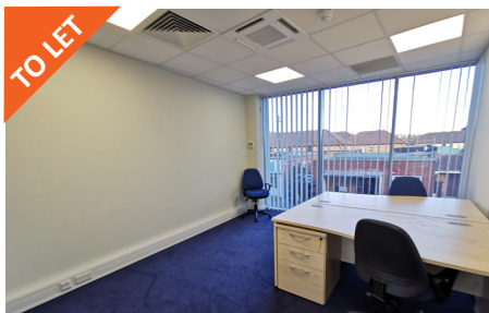
Castle Court, Suite 3A, 1 Castle Street, Portchester, Fareham • 430 sq ft Class E suite • Rent £7,750 PA