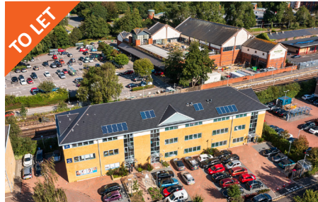
Unit 1, Southern Gate Office Village, Terminus Road, Chichester • 1,674 sq ft Class E unit • Rent £33,500 PA