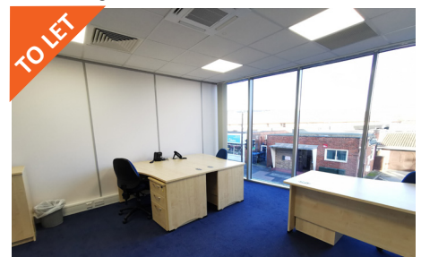
Castle Court, Suite 3B, 1 Castle Street, Portchester, Fareham • 1,895 sq ft Class E suite • Rent £25,600 PA