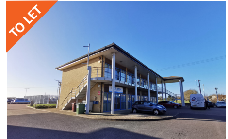
Ground Floor, Unit 10, Donnington Business Park, Chichester • 2,140 sq ft Class E unit • Rent £30,000 PA