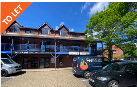
2nd Floor, Unit B1, Beacon House, Northumberland Road, Portsmouth • 527 sq ft Class E unit • Rent £6,800 PA