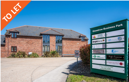
Unit 5, Vinnetrow Business Park, Vinnetrow Road, Chichester • 4,128 sq ft Class E office • Rent £67,500 PA