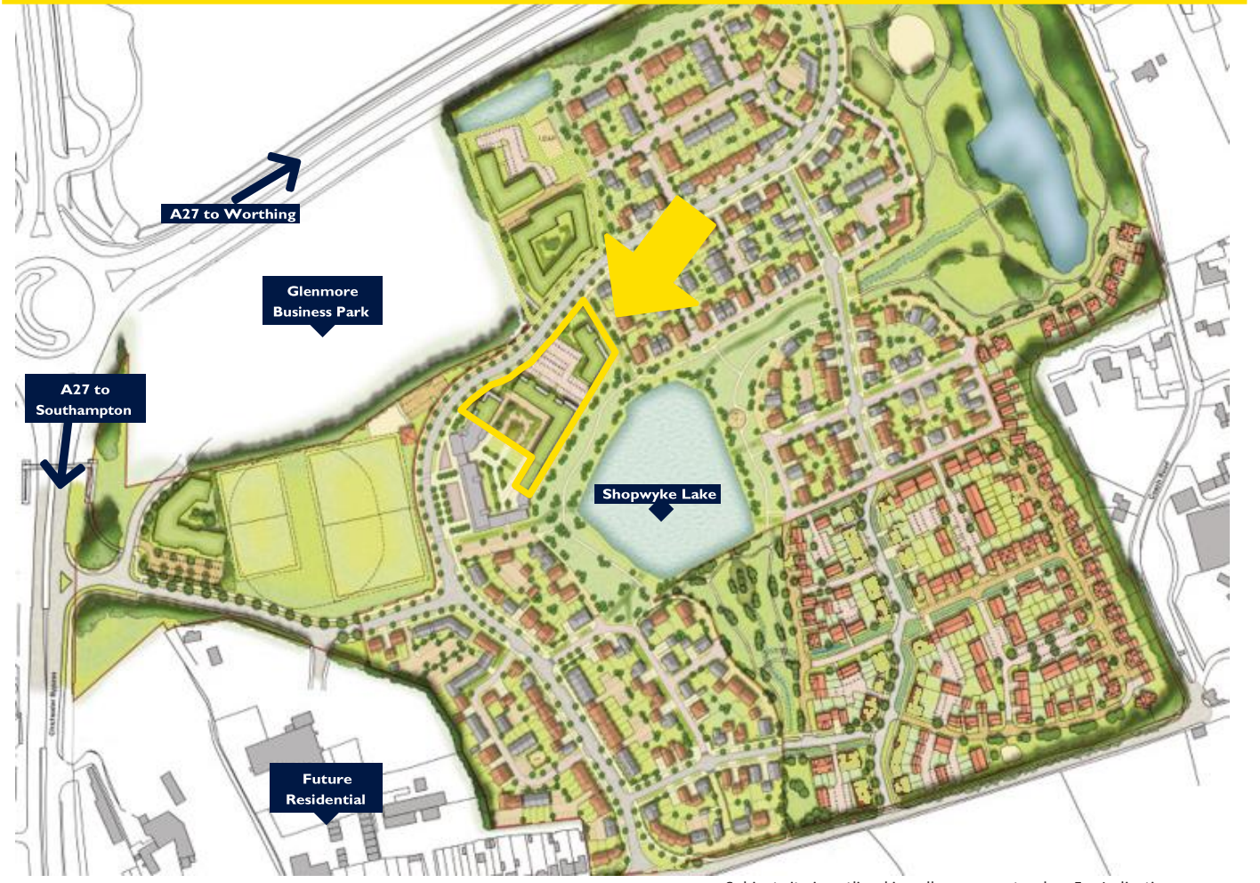
Subject site is outlined in yellow on masterplan. For Indicative purposes only