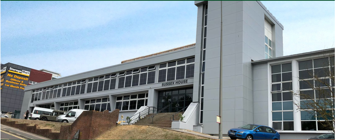
Sussex House Crowhurst Road, Brighton, East Sussex BN1 8AF