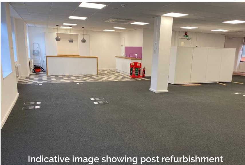
Indicative image showing post refurbishment