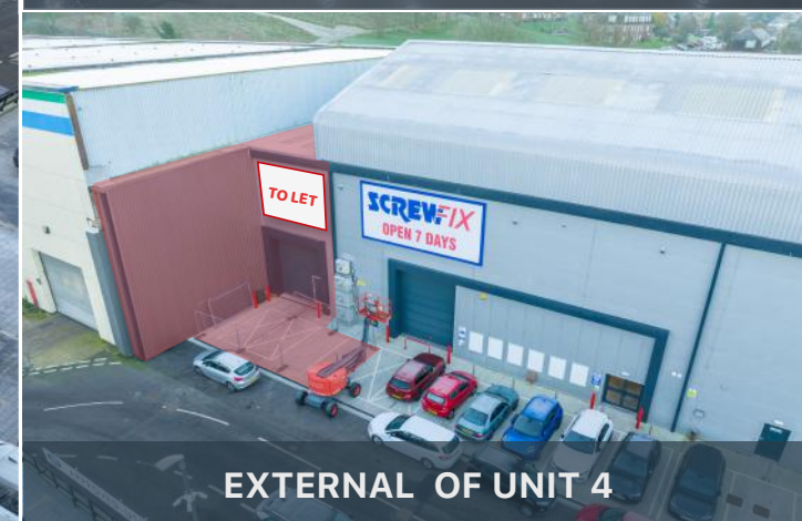
EXTERNAL OF UNIT 4

Prime Trade / Warehouse Units to Let 3,910 to 17,630sq ft (363 to 1,628sq m)