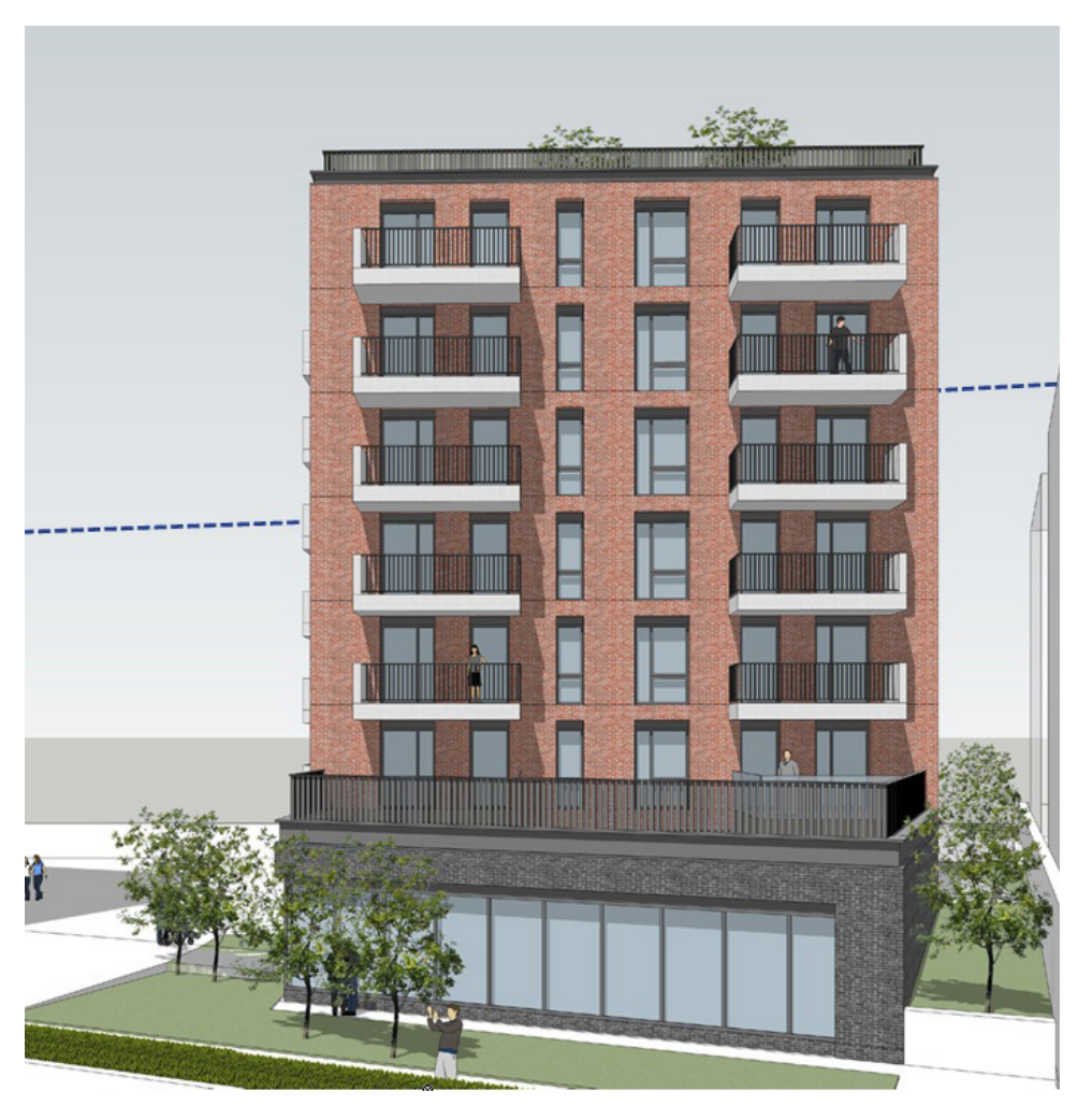
Proposed View - North West - Towards Lyon Close Development