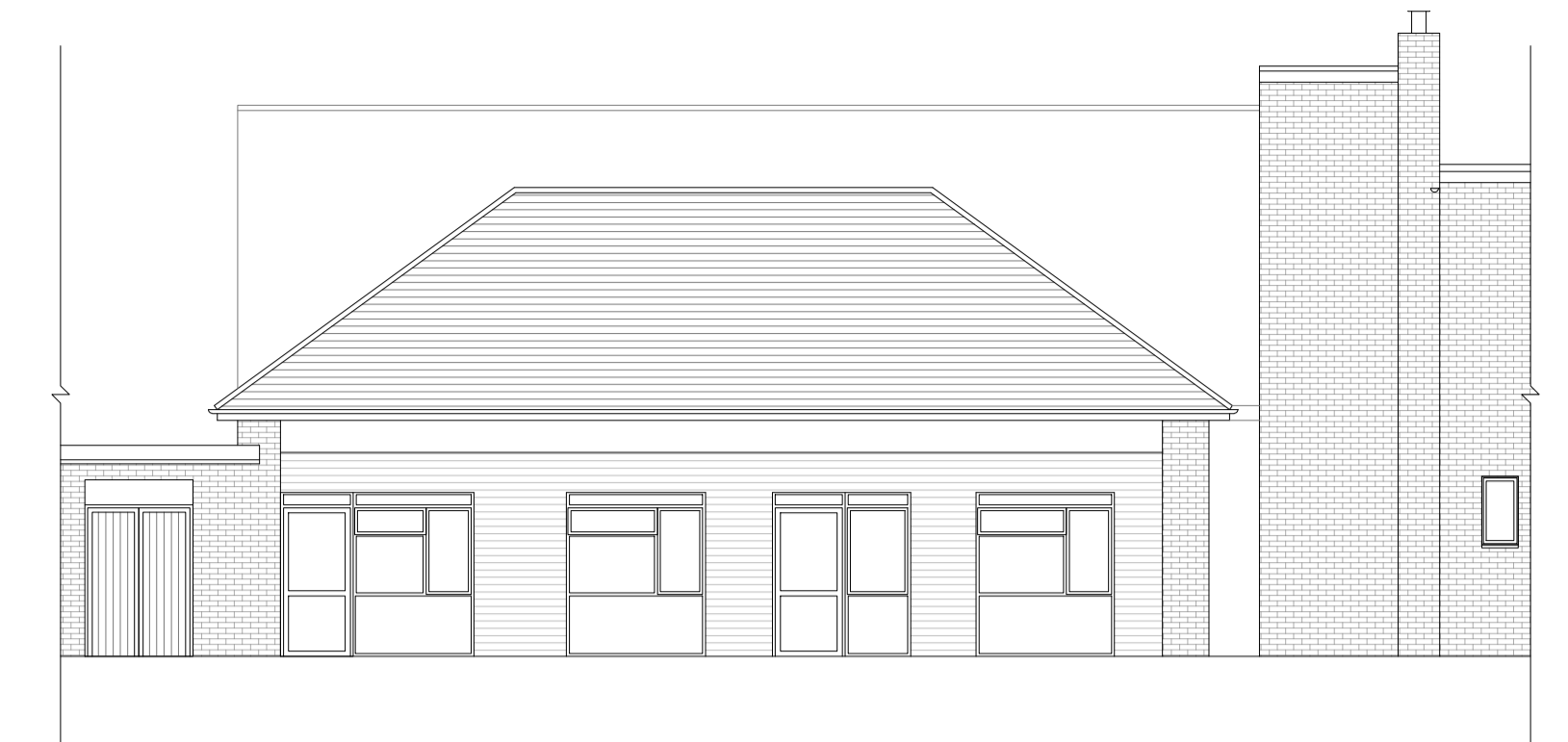
Existing Partial Side Elevation AA 1:100