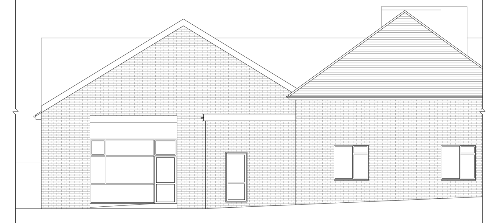
Existing Partial Rear Elevation BB 1:100