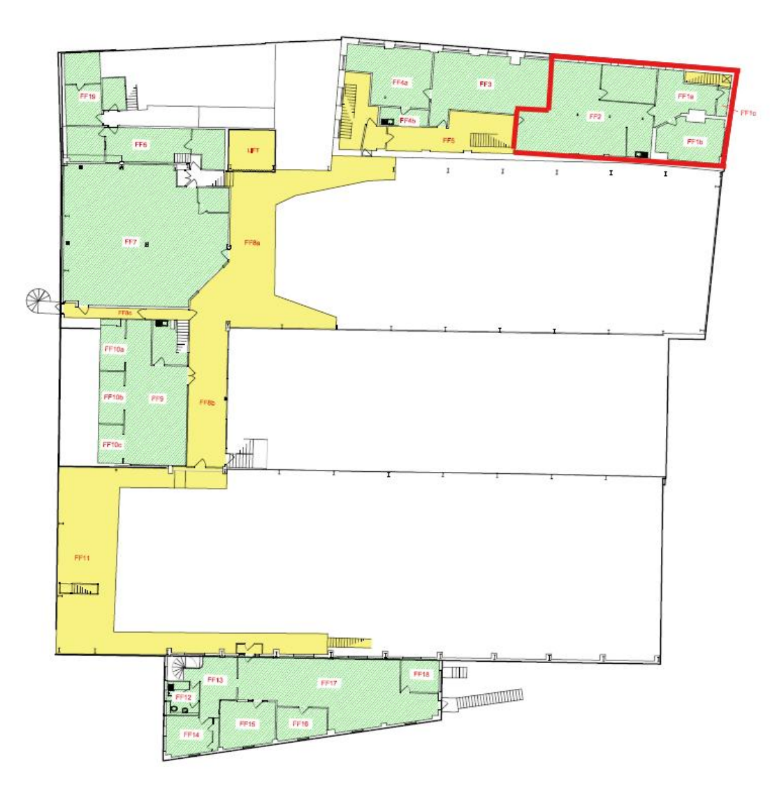
FLOOR PLAN For identification purposes only.