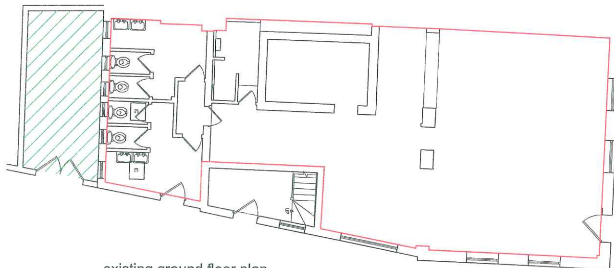
existing ground floor plan

This drawing is the copyright of the Holman Reading Partnership LLP and must not be reproduced in whole or part or used for the execution of works without the permission of the architect. all dimensions to be checked on site prior to commencement of construction works and the architect notified of any discrepancy. figured dimensions are to be used in preference to scaled dimensions. no deviation from this drawing will be permitted without prior consent of the architect. all drawings are prepared subject to a full measured and structural survey of the buildings and site. all structural work is subject to the approval of a structural engineer to confirm and agree the structural proposals. as per licence no 100020449.