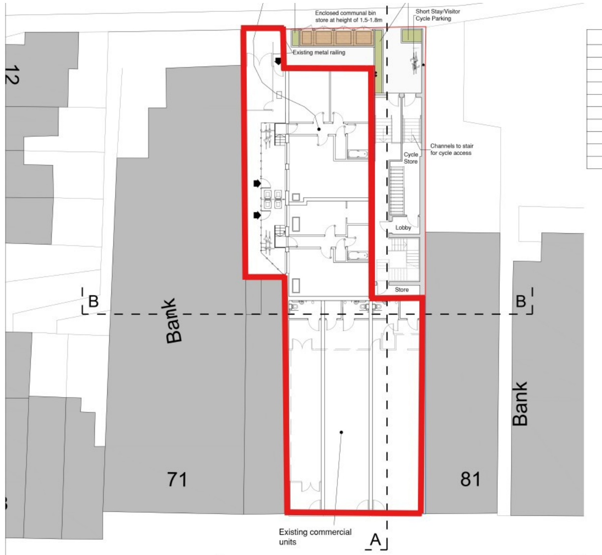
FLOOR PLAN For identification purposes only.