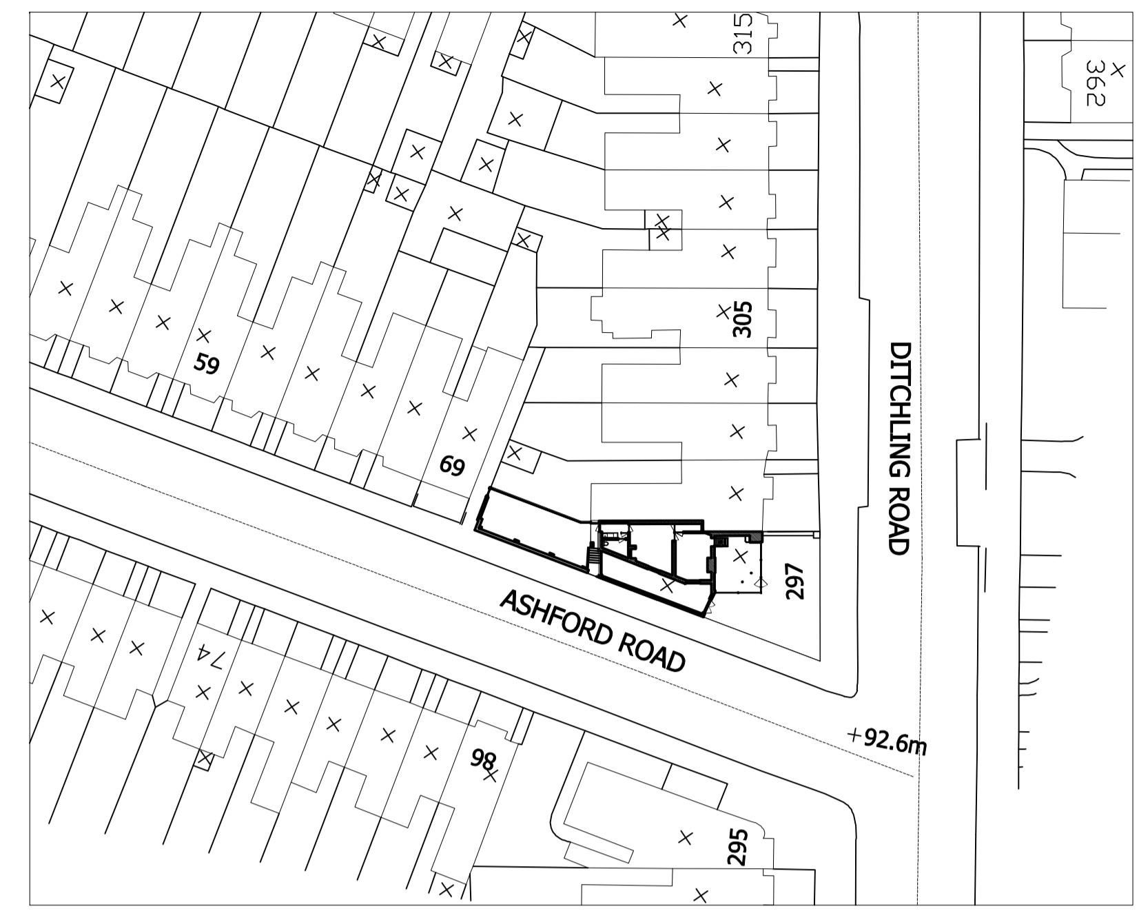
Street View 1:500