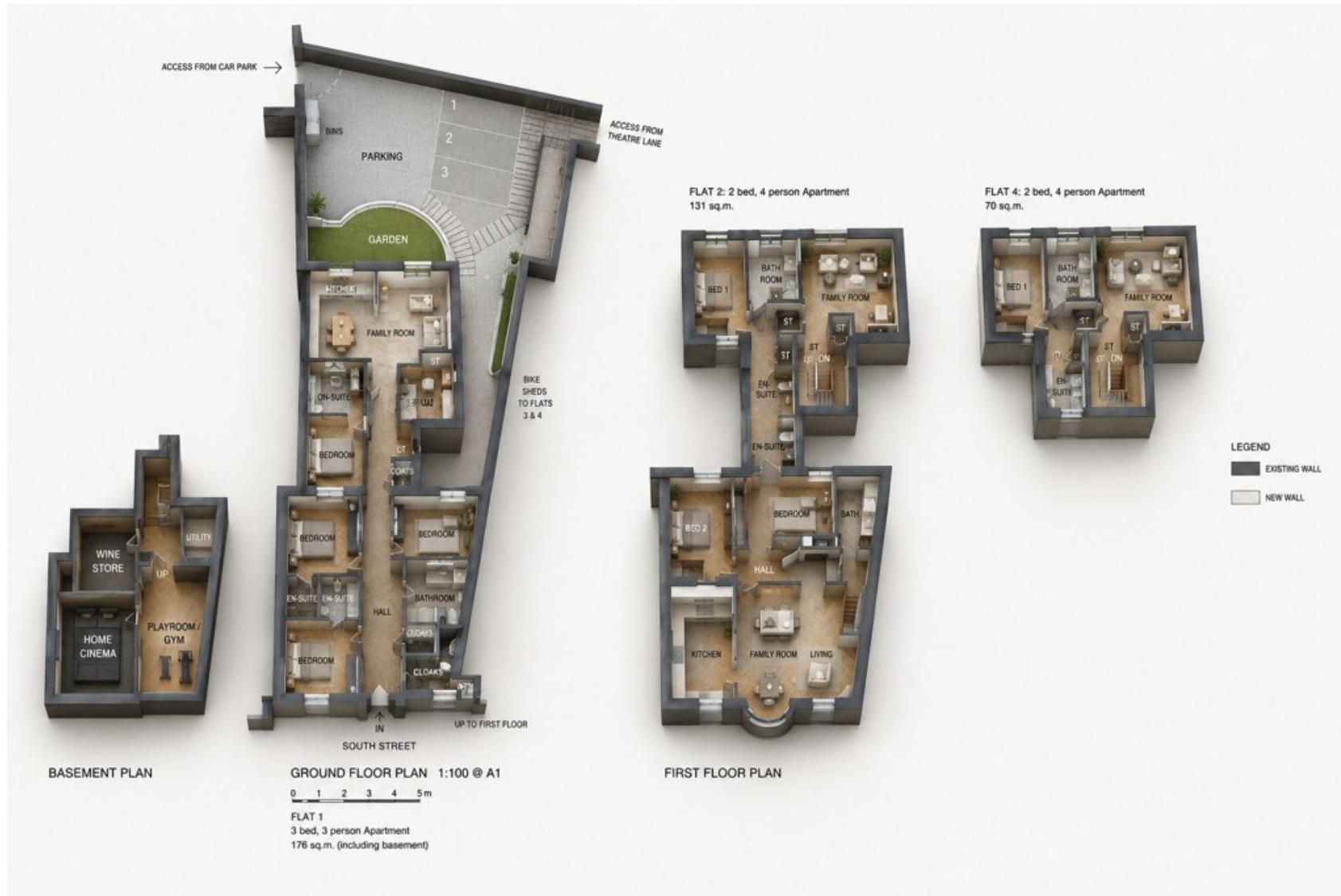
CGI FLOOR PLAN